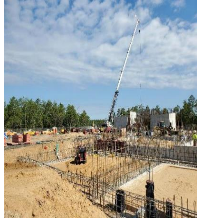
AMTC, Eglin AFB